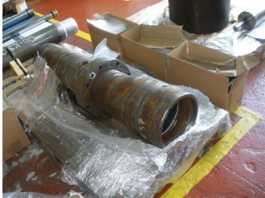
Locking Cylinder In Chrome