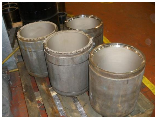
Nickel Plated Cylinders