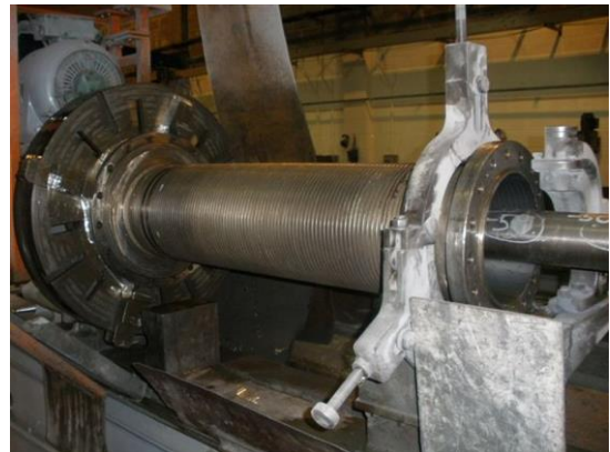
Margarine Tube Getting Ground