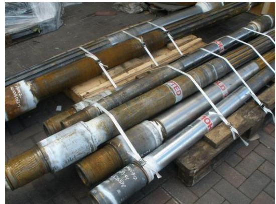
Various Mandrels For Tungsten Carbide Repair