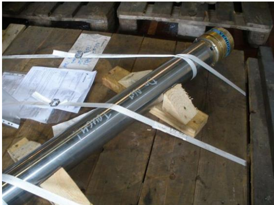
Ram Change Piston For Chrome Repair And Bronze Overlay