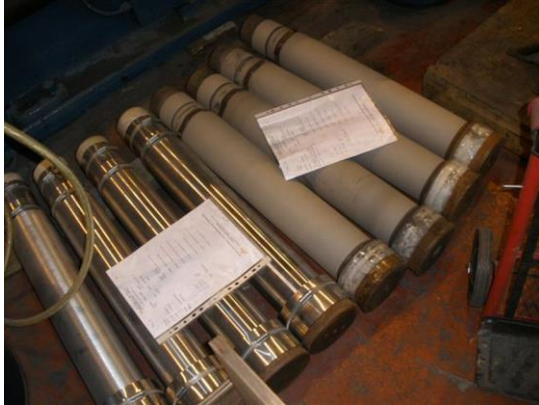
Ram Change Pistons Coated In 1060