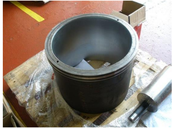
Operating Cylinder In Chrome