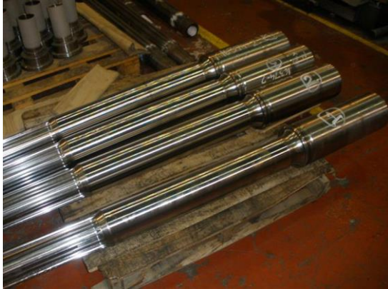
Splined Mandrels Prepared For Coating