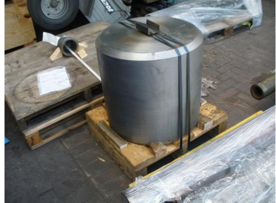
Main Ram In For Coating And Grinding