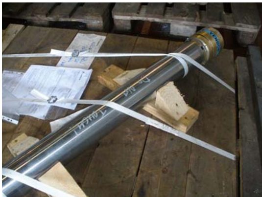
Ram Change Piston for chrome repair and bronze overlay