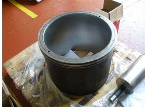
Operating cylinder in chrome