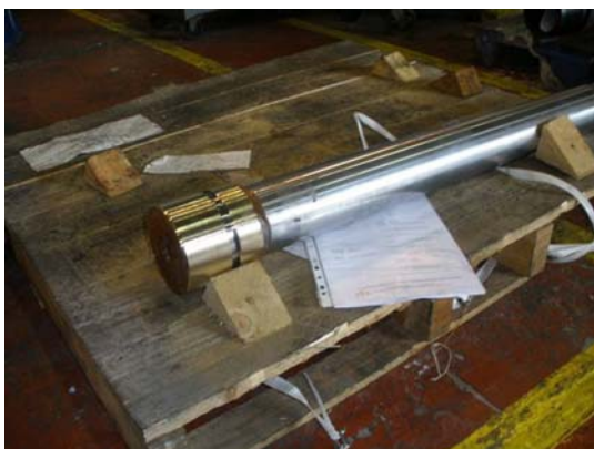
Ram Change Piston