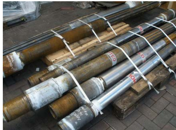
Various mandrels for tungsten carbide repair